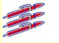
Red pens (need 15 more)

If you can bring in any of the following, email me at gross2@wcpss.net before you purchase and send in, so everyone doesn't get the same thing.